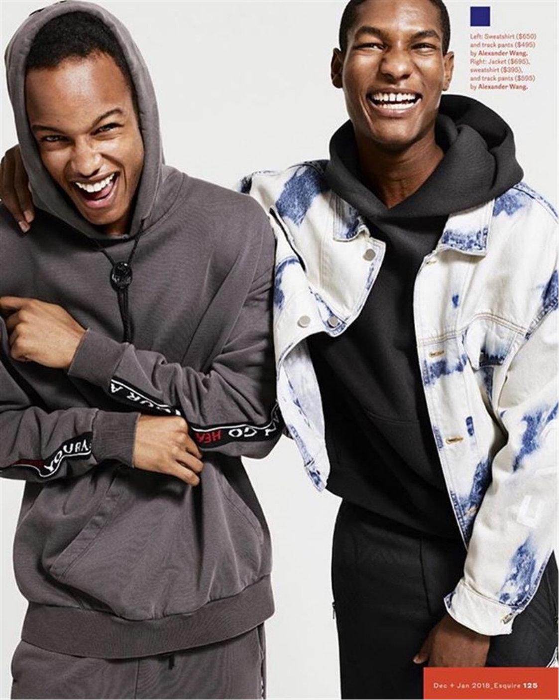
Left: Sweatshirt ($600) and track pants ($495) by Alexander Wang. Right: Jacket ($695), sweatshirt ($395), and track pants ($595) by Alexander Wang.