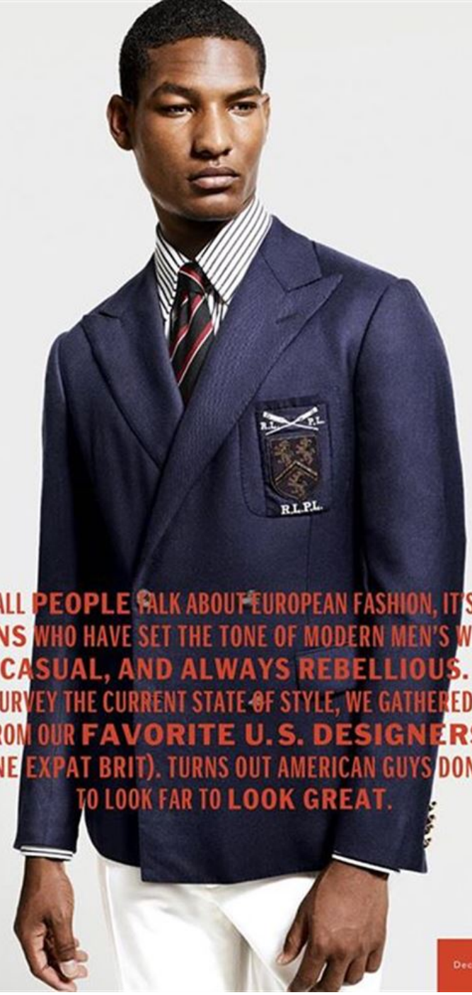
Jacket ($4,995), shirt ($450), trousers ($695), and tie ($235) by Ralph Lauren.