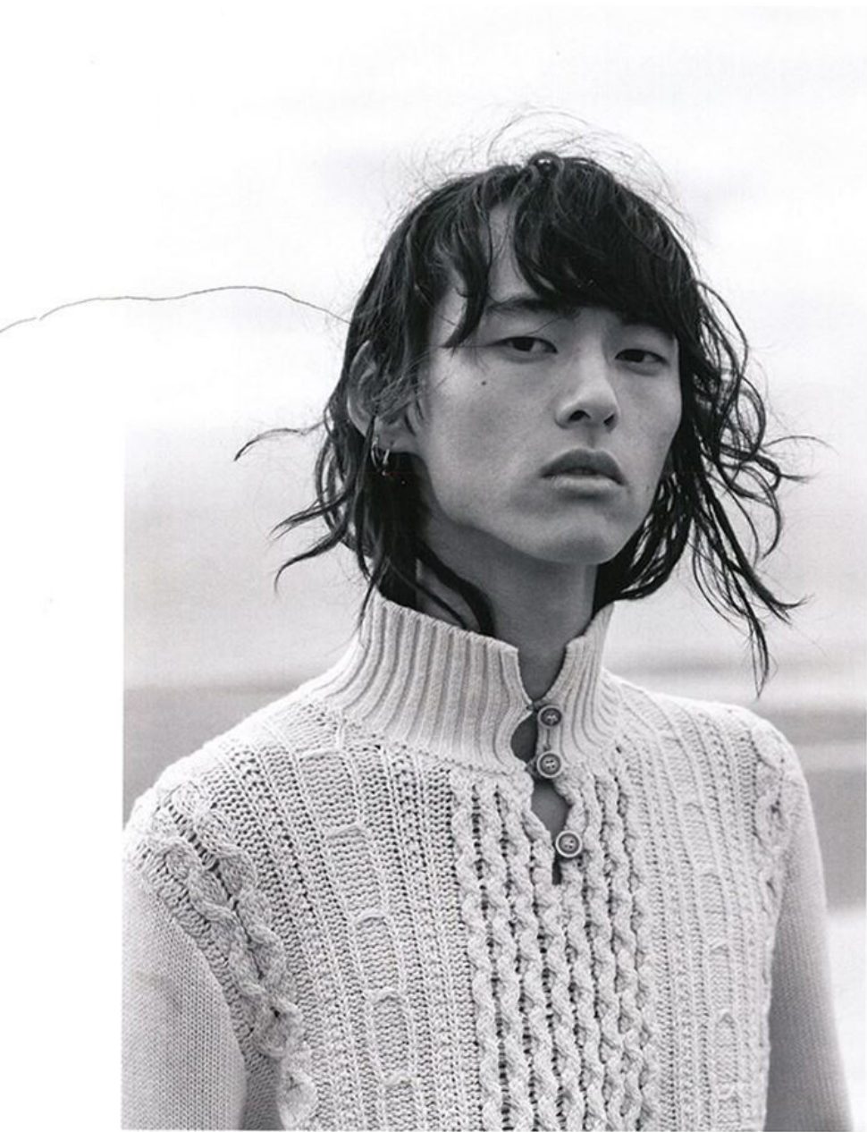
it Kir Knit ANDERSON & SHEPPARD